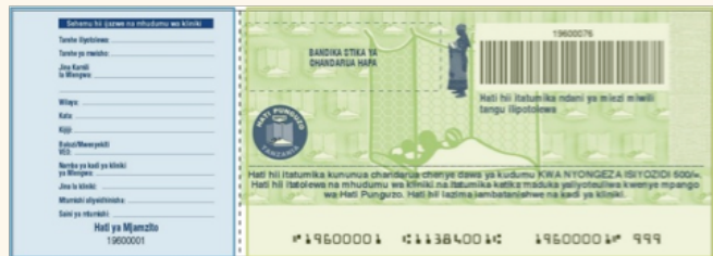
Sample of a TNVS pregnant woman ITN voucher.

Through the TNVS, a pregnant woman receives a voucher at her first routine antenatal check-up, and a child's mother or caregiver receives a voucher when the child is brought to a clinic for measles vaccination at nine months of age. The voucher can be used at participating retailers for a discount on the price of a long-lasting insecticidal net (LLIN). To promote equity, since 2009 the 'top-up' amount that the voucher holder pays is capped at TZS 500.