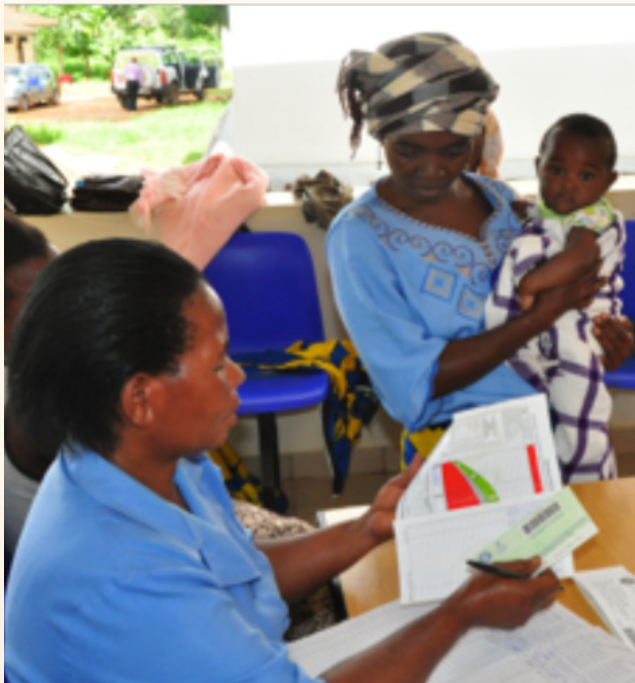
Tanzanian woman redeeming a voucher for a net for her infant under the TNVS.

Ten years ago Tanzania's National Malaria Control Programme embarked on an ambitious endeavour to protect its population at high risk from malaria—namely, pregnant women and children under five. A multi-donor, multi-partner initiative was established to promote nationwide use of insecticide-treated nets (ITNs) and make them affordable, accessible and acceptable. The programme has massively scaled up the use of ITNs in Tanzania by increasing both demand, through mass promotion campaigns, and supply, by developing and supporting public-private partnerships for commercial distribution of ITNs. Since 2004, the Tanzania National Voucher Scheme (TNVS) has provided high-value vouchers, redeemable for ITNs, to pregnant women, and in 2007 an infant voucher was introduced. Between 2008 and 2011, two mass distribution campaigns of long-lasting insecticidal nets (LLINs) for catch up targeted at children under five years, and later for Universal Coverage, substantially boosted net coverage. Throughout this period, the TNVS has helped to maintain high coverage levels among the most vulnerable.