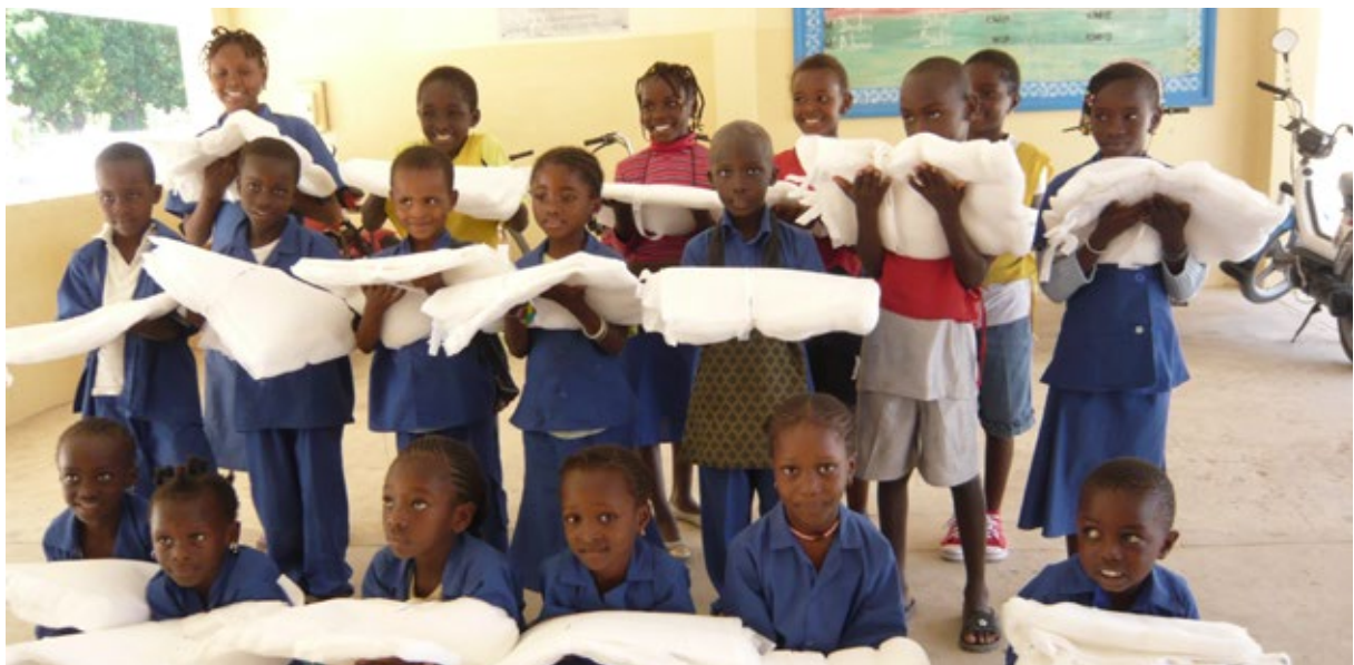
Pupils in a classroom in Ziguinchor, Senegal, display the LLINs they have received at school. (2013)