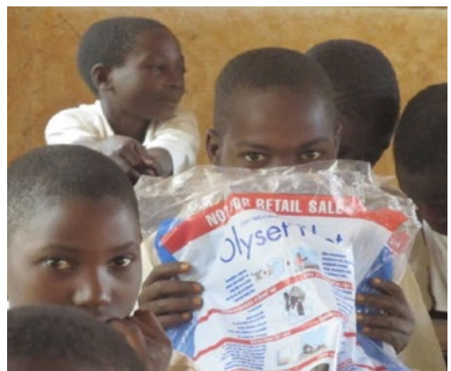
Nigerian students on the LLIN distribution day in Cross River state. (2013)

Use of print materials varied from country to country; materials were primarily used as aides for teachers. Simple and short frequently asked questions laminated cards were reported to be extremely useful. Ghana and Nigeria had a more elaborate teachers' guide, including a range of activities teachers could include in assemblies, class lessons and during distribution itself. Nigeria created a "malaria protection pledge," taught in class and reinforced with a wall poster, where students promised to use a net every night and encourage others to do the same. Other programs gave paper leaflets to children with each net. Programs that did include print materials felt that they played a useful role and plan to continue using them in the future. Careful evaluation of the cost benefit linked to rates of use, care practices or retention of LLINs may be useful given the fairly high cost of print materials.