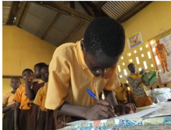
A student in Ghana signs the classroom LLIN register to receive an LLIN (2014).