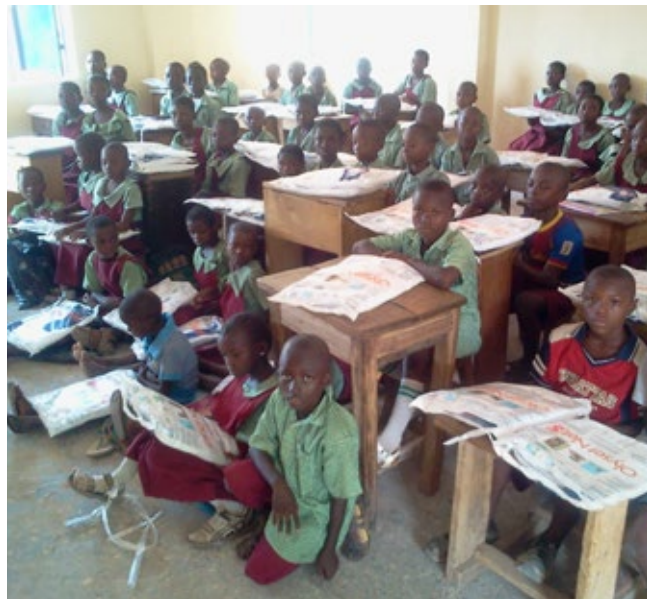
Pupils in Cross River state, Nigeria sit in their classroom after having received LLINs to take home with them. (2013)

Evaluation: A final evaluation will take place after the third round of the pilot in 2014.