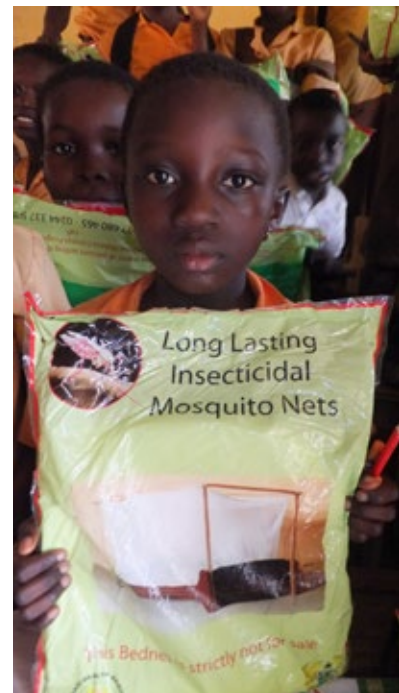
A pupil in Ghana holds the LLIN he received in school that day. (2014)