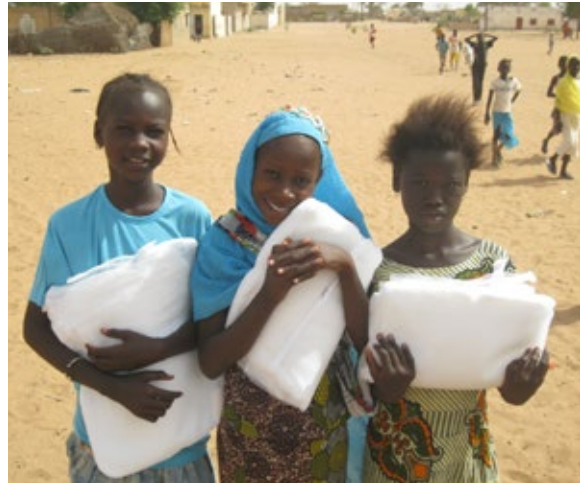
Three schoolgirls receive LLINs in Linguere, Senegal. (2013)