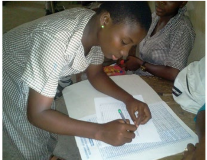
A Nigerian student enters her name in the LLIN register before she receives a net at her school in Cross River state. (2013)

5. Feasibility of distributing LLINs continuously through schools (i.e., as opposed to an annual distribution event). So far all countries have considered annual event distributions more feasible. This is more likely given the potential challenges around identification of the appropriate target group, assuring a robust LLIN audit trail and LLIN storage and security. However, in some specific contexts continuous distribution may be feasible and useful. Experiences in this approach should be tracked and shared.