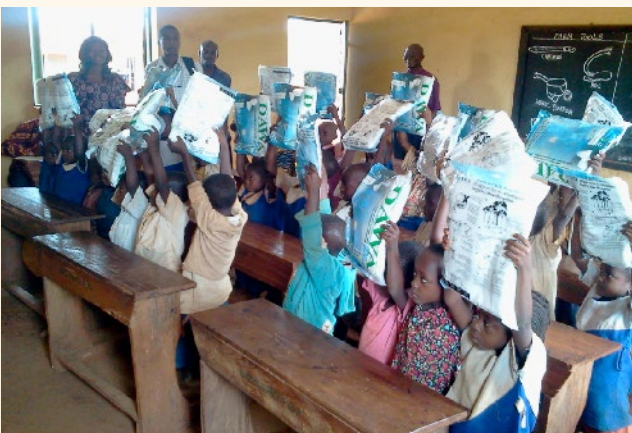
Nigerian students receive nets to take home. School-based distribution of LLINs can be a feasible and effective way to sustain coverage after campaigns.

The school LLIN distribution pilot in Cross Rivers State was innovative in its simplicity. Much of the necessary logistics were already in place and the education sector was a highly motivated partner. In the first round of the pilot, eighty-eight public schools distributed 8,444 nets to students and teachers in Obubra LGA (population 185,000).