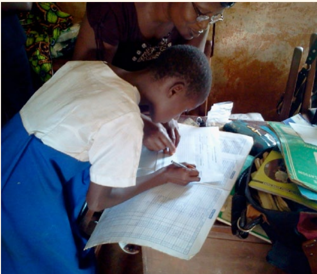
A student signs her name in the distribution register after receiving a net in school.

Planners used second term attendance numbers from school records to calculate the number of nets required. The second term was chosen because attendance usually stabilizes by this time in the school year. The exact number of nets was allocated by the state using leftover nets from the recently completed mass campaign. A buffer stock was considered unnecessary. If any beneficiaries claimed that they should have received a net but did not, the school reviewed their attendance records to ensure that the students were indeed eligible (and did not return to school simply to obtain a net). Missed beneficiaries were scheduled to receive nets in the following year even if they had moved on to the next grade.